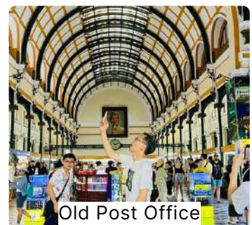
Old Post Office