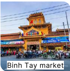
Binh Tay market