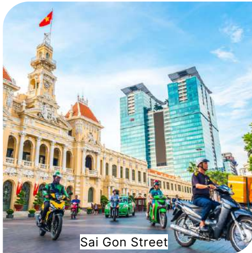
Sai Gon Street