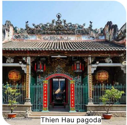
Thien Hau pagoda