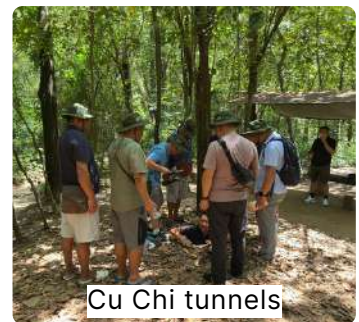
Cu Chi tunnels

Distance Saigon Central – Cu Chi Tunnel: 70 km => 2 hour transfer